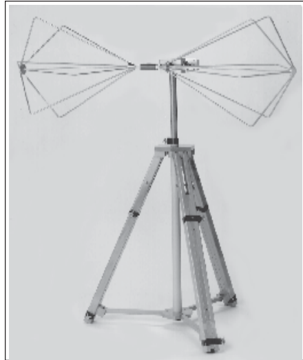
Figure 1.1 Biconical Antenna (w/ tripod AT-100)