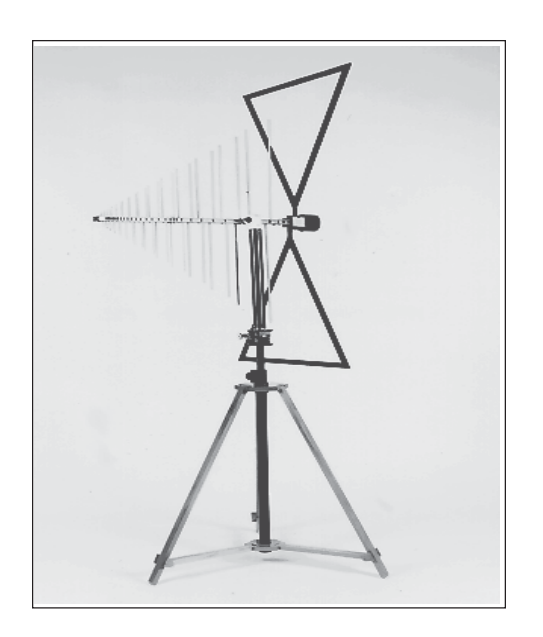
Figure 1-1. Combilog mounted on AT-100 tripod.