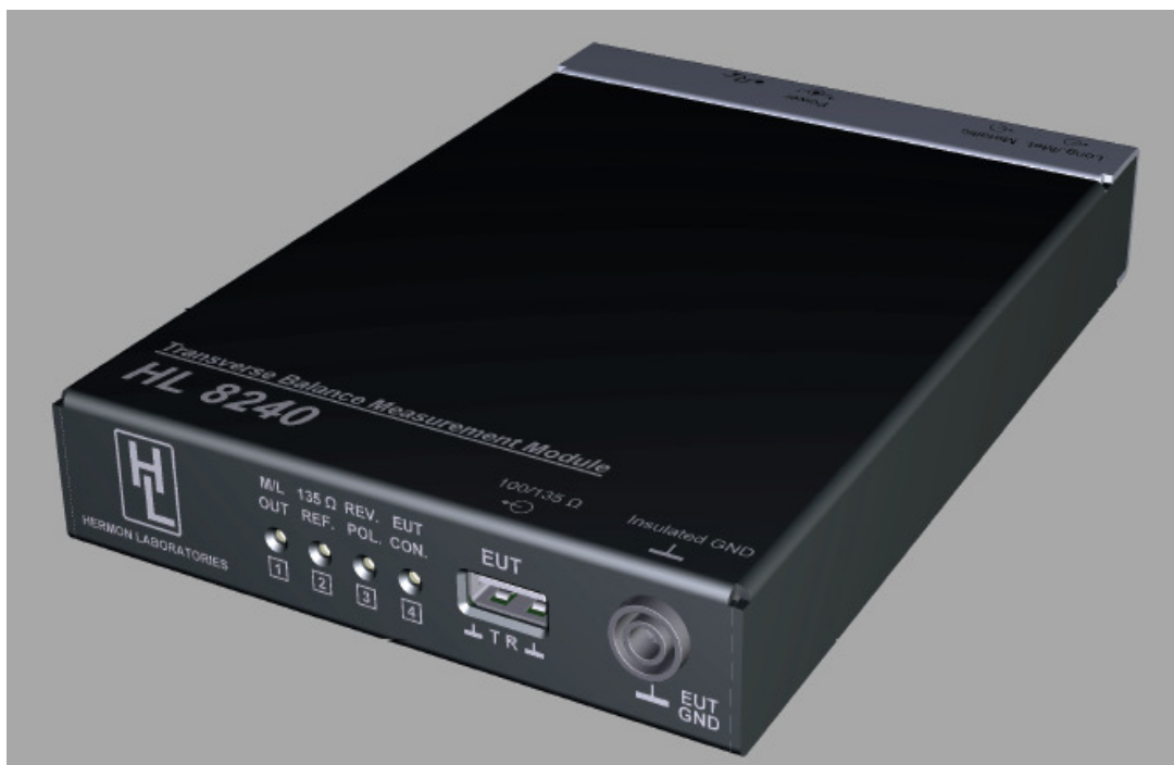
Figure 1 A general view of the Transverse balance measurement module HL 8240

Transverse balance measurement module HL 8240 is designed for automatic compliance testing of telecom equipment for transverse balance.